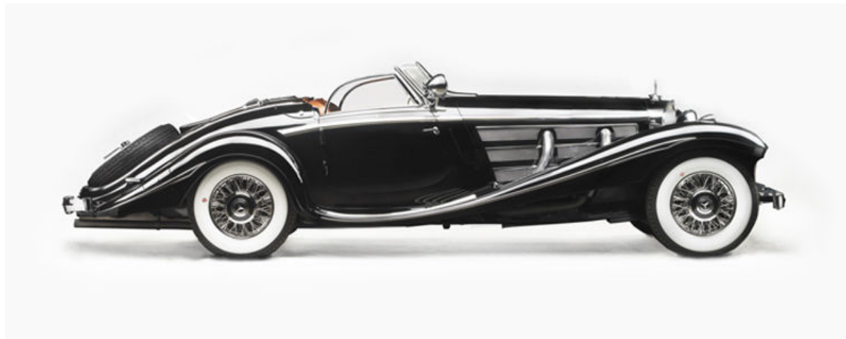
The sensational von Krieger Special Roadster, a 1936 Mercedes-Benz 540 K, will be presented at Gooding & Company's 2012 Pebble Beach Auctions on August 18 & 19.

SANTA MONICA, Calif. (June 13, 2012) – Seventy-six years after leaving the factory, one of the world's most extraordinary Mercedes-Benz motor cars will be presented for public sale for the first time at Gooding & Company's prestigious Pebble Beach Auctions on August 18 & 19. With remarkable lineage, exceptional provenance and a rich international history akin to a Hollywood romance, the sensational von Krieger Special Roadster, a 1936 Mercedes-Benz 540 K, will be the most significant Mercedes-Benz to ever come to auction when it crosses Gooding & Company's Pebble Beach stage later this summer.