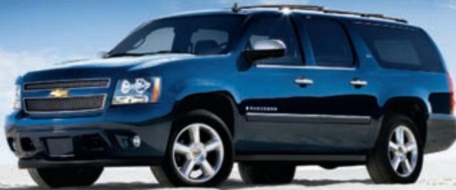
Suburban half-ton LTZ 4x4 in Dark Blue Metallic with available features

For 73 years, Chevy Suburban has filled your big needs with powerful Vortec engines like the standard 5.3L V8 engine in half-ton models that incorporates Active Fuel Management technology and helps Suburban 2WD offer an EPA estimated MPG 20 highway. We know families travel in Suburban every day, so the list of standard safety features includes StabiliTrak and head-curtain side-impact air bags 1 for all rows. 2009 half-ton models earned the highest possible rating in government frontal and side-impact crash tests — five stars 2