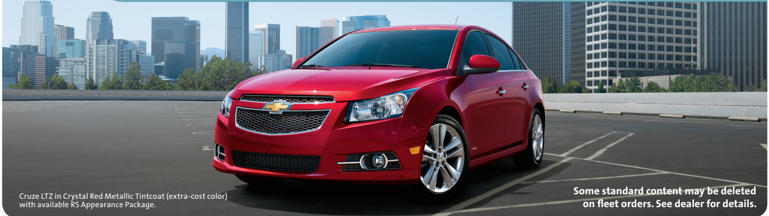
Cruze LTZ in Crystal Red Metallic Tintcoat (extra-cost color) with available RS Appearance Package.

More Than Ready. After 4 million miles of durability testing around the world, Cruze is more than ready to handle whatever your world happens to throw at it. More Safety. Cruze looks out for you with 10 standard air bags 1 including frontal, front side-impact, roof rail-mounted head-curtain, rear-side impact and new front knee air bags. Whew. More Room. Cruze spoils you with more interior room and cargo space than Toyota Corolla and Honda Civic.