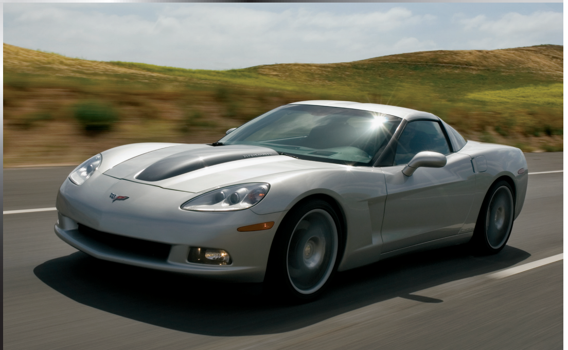
car shown with optional equipment