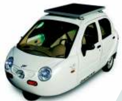
Xebra Xero SOLAR ZAPCAR