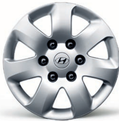
17-INCH LIMITED ALLOY WHEEL