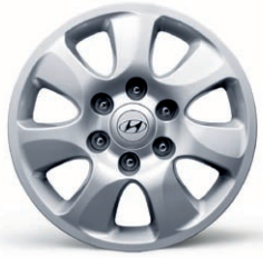
16-INCH GLS WHEEL COVER