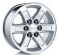
N88 17-inch polished aluminum wheel. Standard with SLT trim; available with SLE trim (1/2-ton models only).