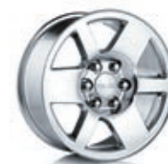
QF8 18-inch polished aluminum wheel. Standard on Yukon Denali and Yukon XL Denali.