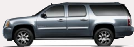
YUKON XL DENALI

Denali includes SLT trim level standard features with Denali standard features as enhancements