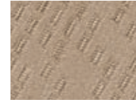
LIGHT TAN (Not available with Steel Gray Metallic exterior)