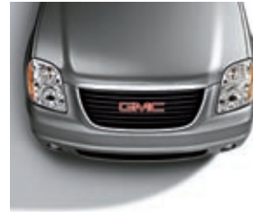
STEEL GRAY METALLIC