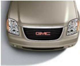
GOLD MIST METALLIC