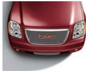
RED JEWEL TINTCOAT 1