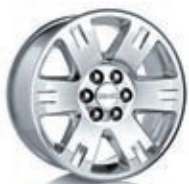
RDP 20-inch polished aluminum wheel 1 . Available with SLE-2, SLT trim (1/2-ton models only).