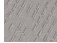
LIGHT TITANIUM (Not available with Gold Mist Metallic exterior)