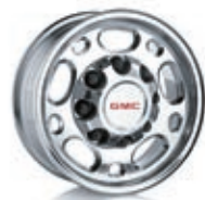
PY0 16-inch, eight-lug polished forged aluminum wheel (standard on Yukon XL 3/4-ton models).