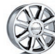
P41 20-inch chrome wheel 1 . Available on Yukon Denali and Yukon XL Denali.