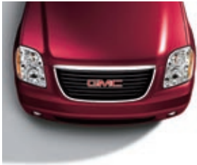
SONOMA RED METALLIC