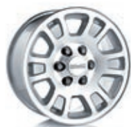
QF7 17-inch bright aluminum wheel. Standard with SLE trim.