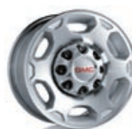
N89 17-inch, eight-lug bright machined aluminum wheel (available on Yukon XL 3/4-ton models).