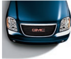
DEEP BLUE METALLIC