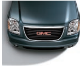
STEALTH GRAY METALLIC 1