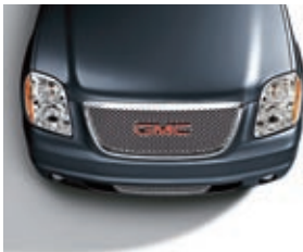
DARK SLATE METALLIC