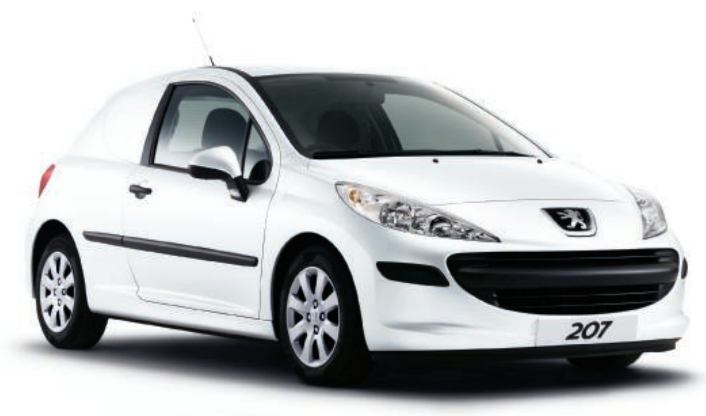
Model shown: 207 I.6 HDi with Hobart wheel trims

Put the 207 Van on your workforce, and we think you'll be seriously impressed. One look at its clean profile, dynamic lines and strong, iconically Peugeot front grille instantly tells you it means business. Get behind the wheel and you'll