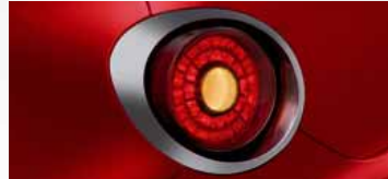
Titanium grey surrounds