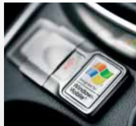
Blue&Me™ USB port