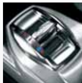
Alfa Romeo D.N.A. (vehicle's dynamic control switch)