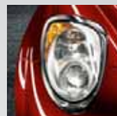
Polished headlight surround