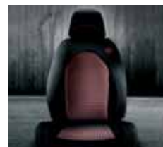
210 - 231 Black-Red