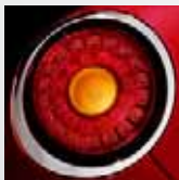
LED rear lights