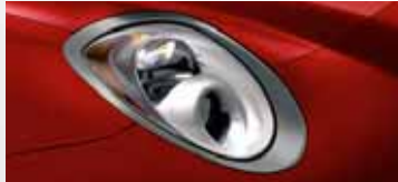
Titanium grey surrounds