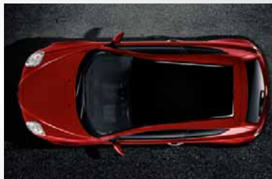
Black painted rear