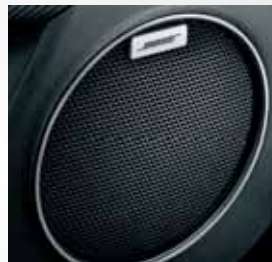
Hi-Fi Bose® sound system

(1) (2) On Alfa MiTo Turismo must be ordered with opt. 320/709 radio controls on steering wheel. Price does not include cost of this option.