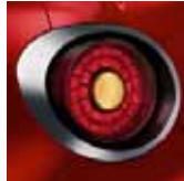
Satin chrome surrounds