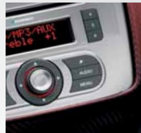
Radio system RDS with CD/mp3 player + 8 speakers + subwoofer + auxiliary amplifier