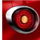
Polished chrome surrounds