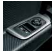
Electric windows with one touch function