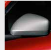
Satin chrome cap