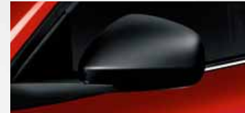
Opaque black cap