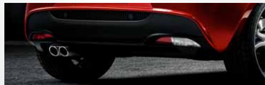
Sports bumper with extractor and twin chrome exhaust tail pipe