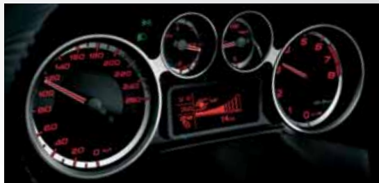
On-board instrument with red light (Turismo/Lusso)