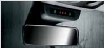
SBR (Seat Belt Reminder): seatbelt reminder display

● - standard ○ - option - - not available