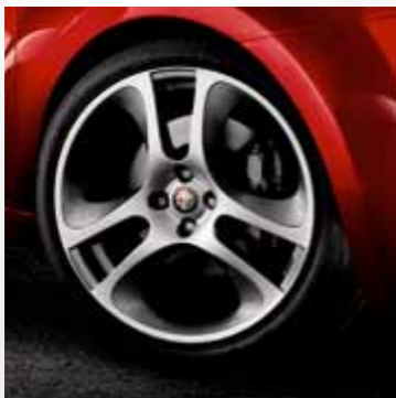
439 - 18" Sports alloy wheel 215/40 (optional)