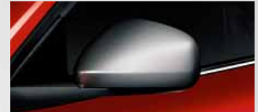
Titanium grey cap