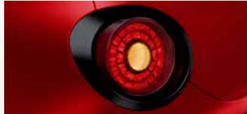
Opaque black surrounds