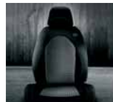
208 - 239 - 248 Black-Black