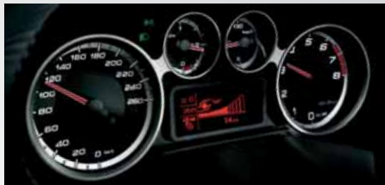
On-board sports instrument with white light (Veloce)

● - standard ○ - option - - not available