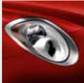
Satin chrome surrounds