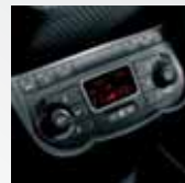
Automatic dual zone climate control