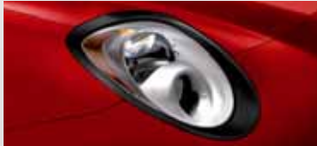
Opaque black surrounds