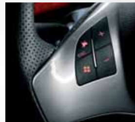
Radio/mobile phone controls on steering wheel