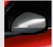
Polished chrome cap