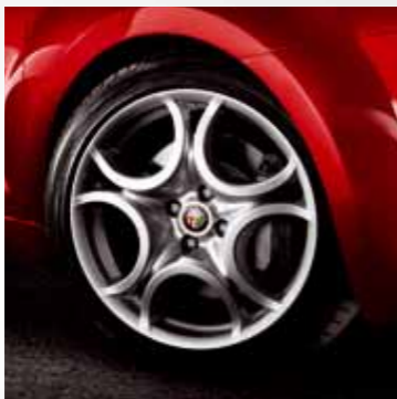
431 - 17" Exclusive design alloy wheel 215/45 (standard on Veloce)