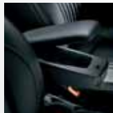
Front armrest with storage compartment