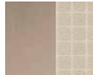
CAMEL LEATHER/SAND ALCANTARA ® INSERTS ■