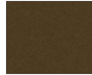
STONE GREEN 1