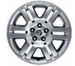
18" SATIN-ALUMINUM CHROME-CLAD STANDARD ON PREMIER