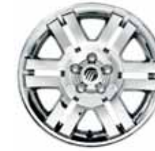
18" BRIGHT CHROME-CLAD AVAILABLE ON PREMIER WITH CHROME PACKAGE