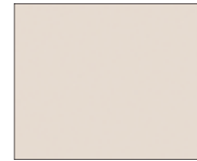
WHITE CHOCOLATE TRI-COAT 3

Mercury uses clearcoat paint for beauty and protection. All exterior paints are Metallic except for White Suede and Black. Colors are representative only. 1 New for 2008. 2 Available on Chrome Package. 3 Available on Premier only.