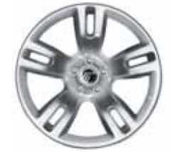
20" POLISHED-ALUMINUM AVAILABLE ON PREMIER