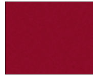
VIVID RED 2