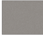
VAPOR SILVER 1,2