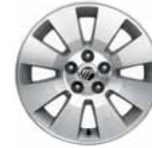
17" MACHINED-ALUMINUM STANDARD ON MOUNTAINEER