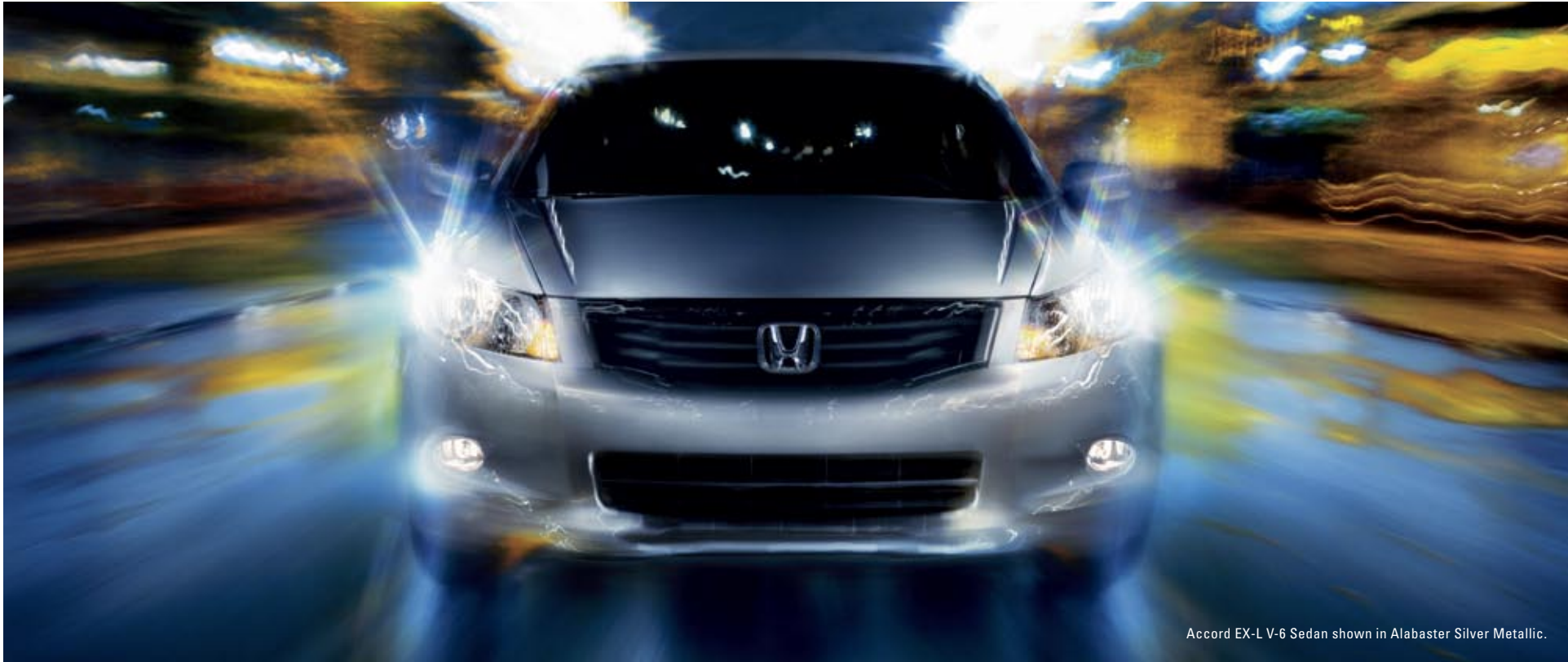
Accord EX-L V-6 Sedan shown in Alabaster Silver Metallic.