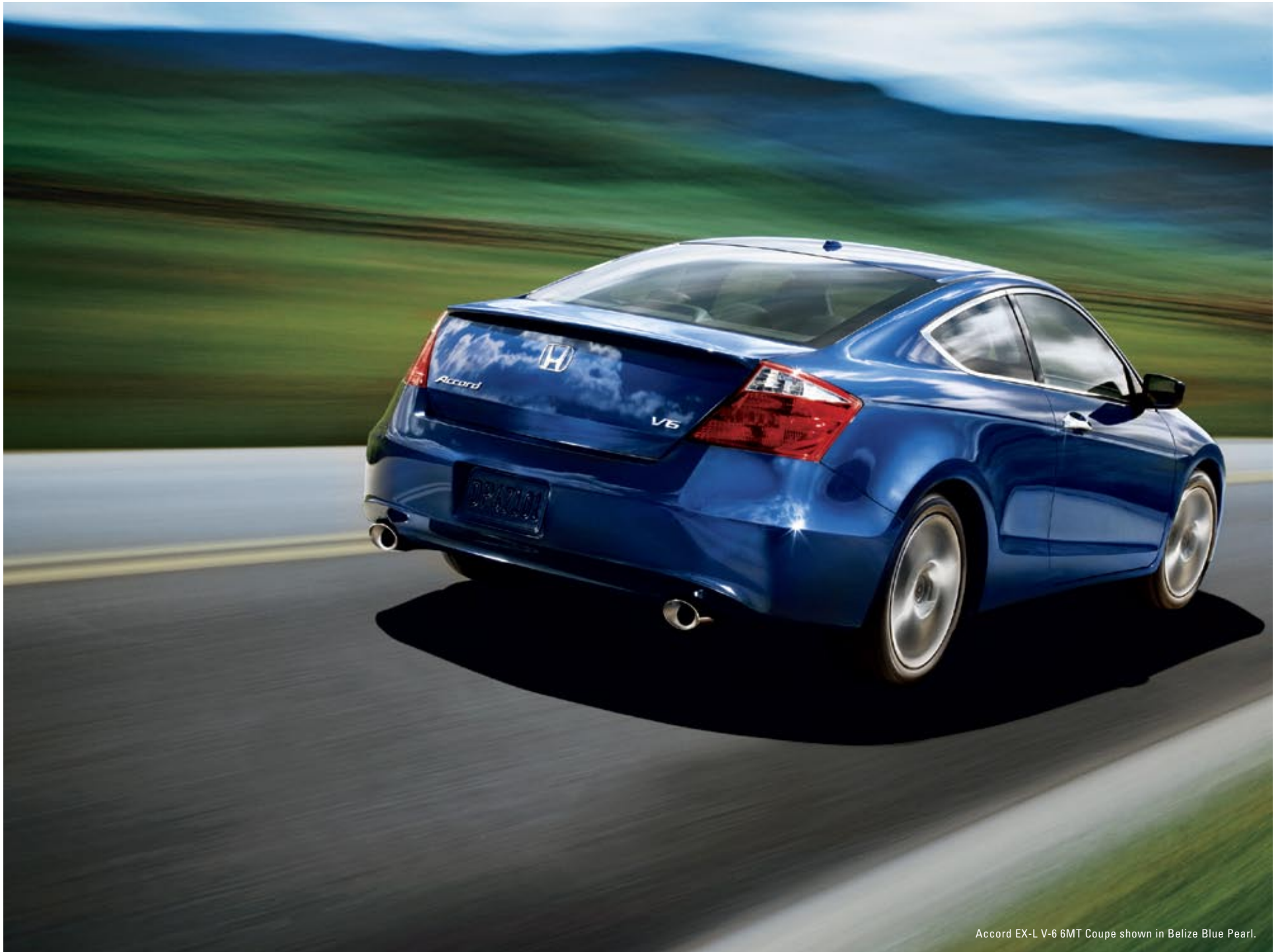
Accord EX-L V-6 6MT Coupe shown in Belize Blue Pearl.