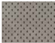
Medium Light Stone Leather Standard on Limited; Available on SEL