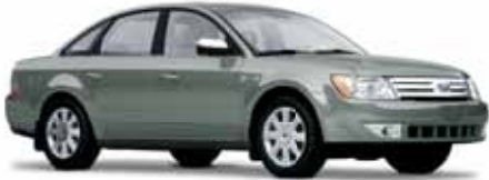
Titanium Green Metallic