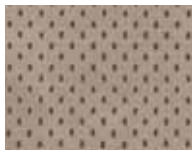
Camel Leather Standard on Limited; Available on SEL