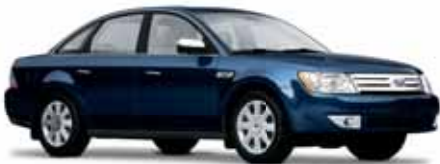
Dark Ink Blue Metallic