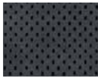
Black Leather Standard on Limited