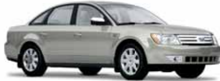
Light Sage Metallic