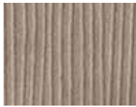
Camel Cloth Standard on SEL