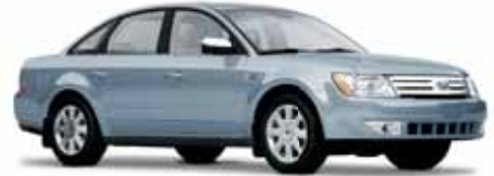
Light Ice Blue Metallic