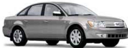
Silver Birch Metallic