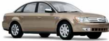
Dune Pearl Metallic