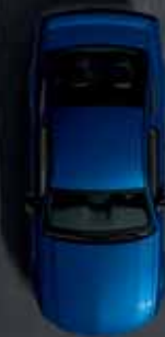
Vista Blue Metallic