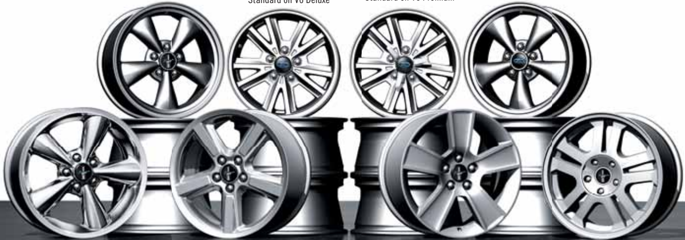
18" Polished-Aluminum with Tri-Bar Pony Center Cap Available on GT; Standard with GT California Special Package