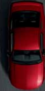
Dark Candy Apple Red Metallic