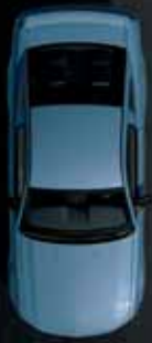
Windveil Blue Metallic