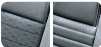
GT CLOTH Stampeding Horse Pattern