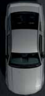
Vapor Silver Metallic