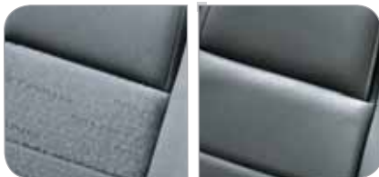
V6 CLOTH MUSTANG Pattern