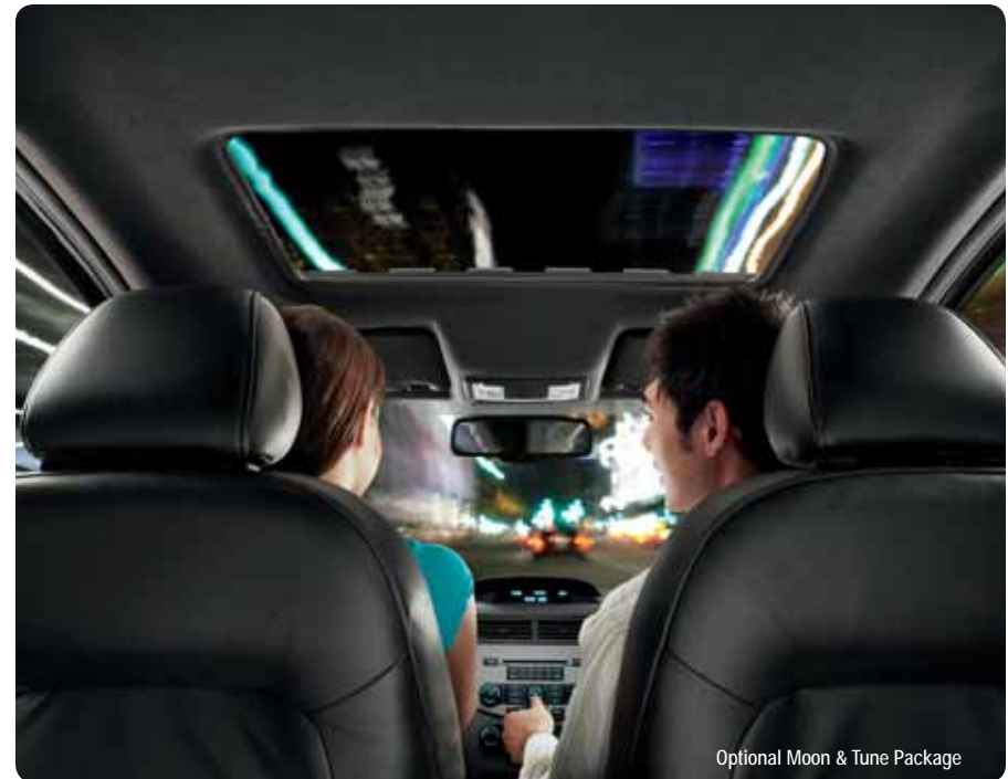
Optional Moon & Tune Package

Comparisons based on 2008 competitive models (Compact Car class), publicly available information and Ford certification data at time of release. Some features discussed may be optional. Vehicles shown may contain optional equipment. Features shown may be offered only in combination with other options or subject to additional ordering requirements or limitations. Dimensions shown may vary due to optional features and/or production variability. Following release of this PDF, certain changes in standard equipment, options and the like, or product delays may have occurred which would not be included in these pages. Your Ford Dealer is the best source for up-to-date information. Ford Division reserves the right to change product specifications at any time without incurring obligations.