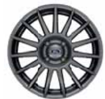
17" Premium Painted Dark Stainless Aluminum Standard on SES Coupe; Optional on SES Sedan