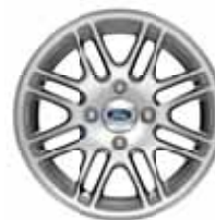
15" Aluminum-Alloy Standard on SE Sedan