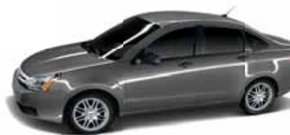
Sterling Grey Metallic