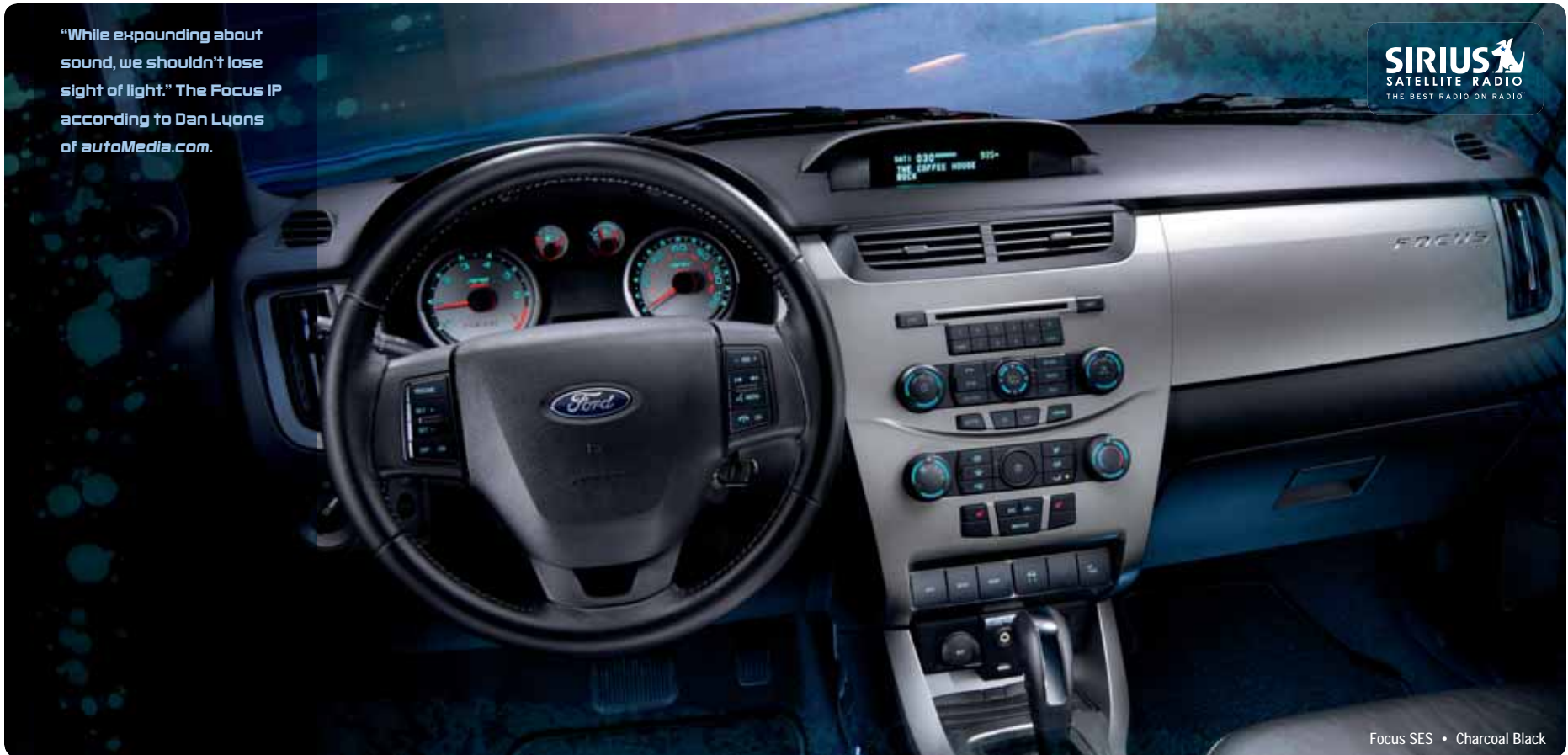
Focus SES • Charcoal Black