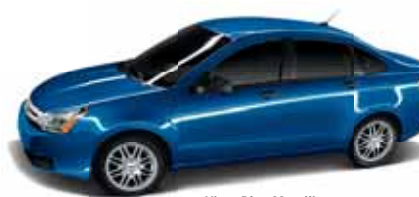
Vista Blue Metallic