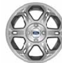
16" Aluminum-Alloy Standard on SE Coupe and SES Sedan