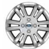
16" Euroflange Aluminum-Alloy Standard on SEL Sedan