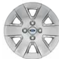
15" Wheel Cover Standard on S Sedan