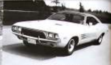
1972 DODGE CHALLENGER