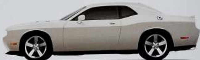
Challenger RT shown in Stone White