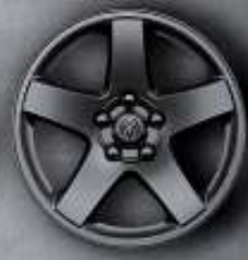
17-inch Machined-Face Aluminum. Standard on SE.