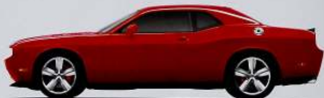
Challenger SRT8 shown in Torred