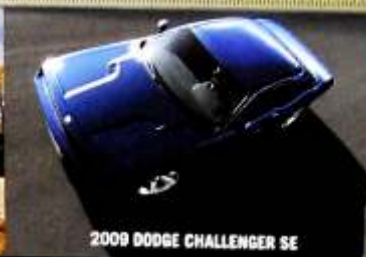
2009 DODGE CHALLENGER SE