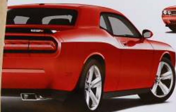
Challenger SRT8 ®