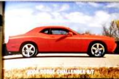
2009 DODGE CHALLENGER R/T