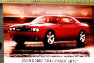
2009 DODGE CHALLENGER SRT8®