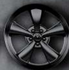
20-inch Polished Heritage. Standard on RT Classic.