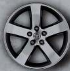
16-inch Cast Aluminum. Standard on RT. Optional on SE.