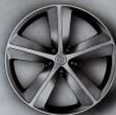
20-inch SRT ® Forged Aluminum. Standard on SRT8 ® .