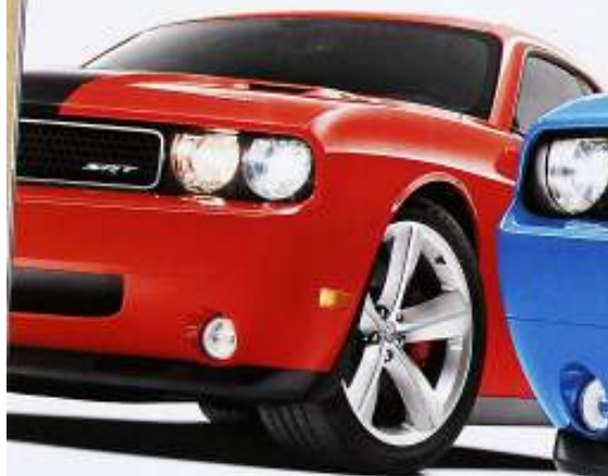
Challenger SRT8 shown in Red Orange