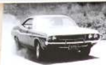
1970 DODGE CHALLENGER