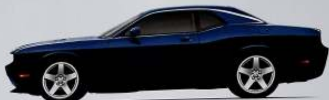
Challenger SE shown in Deep Water Blue Metallic