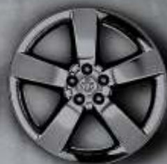
20-inch Chrome-Dial Cast Aluminum. Optional on RT.