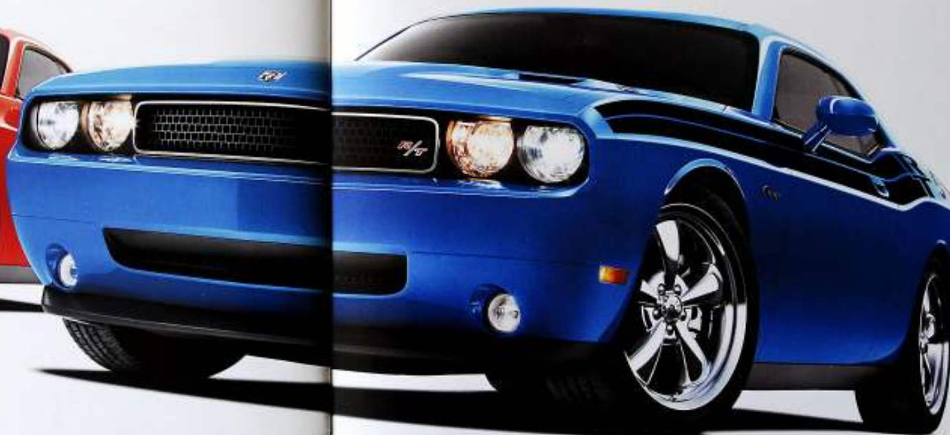
Challenger R/T Classic shown in BS Blue

Those looking to offer a tribute to the 1970s' original road look no further than a Challenger R/T Classic SM or SRT8 SM Spring Special SM clad exclusively in BS Blue from the Chrysler paint code archives. The R/T Classic's scripted fender badge is a nod to the one that started it all. It features a varied performance hood that increases airflow while cooling the 5.7-liter VVT HEMI SM V8. The polished chrome 20-inch Heritage wheels may be right-size in size, but they're pure throwback in style, along with the side-slate stripes. Clad in SRT8 in BS Blue and it will be decked with a performance hood that gives its 6.1-liter HEMI SRT8 SM V8 engine some breathing room. Like eye black on a fireman's cheekbones or paint on a lion's mane, the SRT8 hood is knocked down in a matte black hood stripe and it's ready for battle. Its interior, however, turns it right back up with blue accents on its performance-tuned seats.