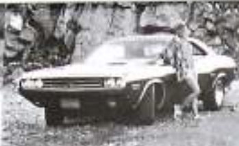
1971 DODGE CHALLENGER