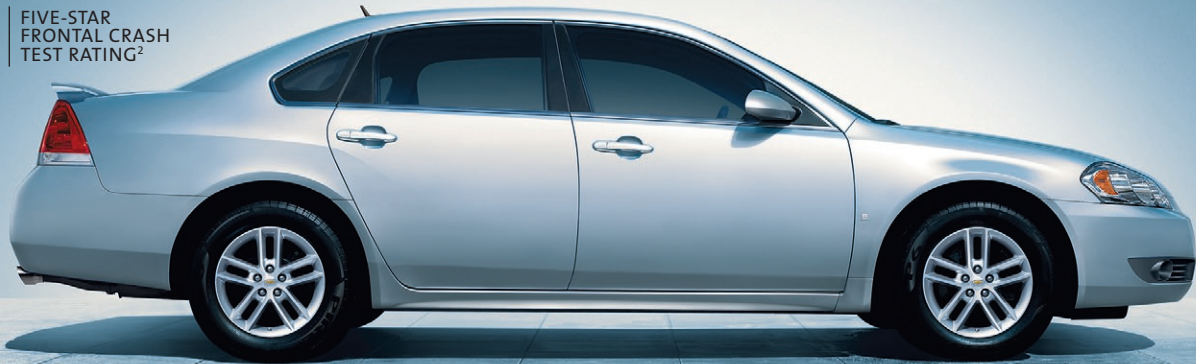
Impala LTZ shown (EPA est. 27 MPG hwy.) in Silver Ice Metallic with available features.