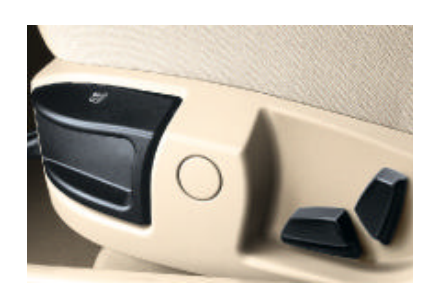
■ Partly electric seat adjustment for driver and front passenger, with electric seat height and backrest adjustment, manual forward/backward adjustment and manual seat angle adjustment on the driver's side.