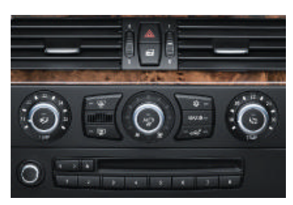
□ Automatic air conditioning, extended with AAR, solar sensor and fogging sensor, automatic temperature control and air distribution (separate for driver and passenger) also air volume control; status and settings shown on the Control Display. With adjustable armrest and air-conditioned storage tray in centre console (standard on 540i, 550i and 535d).