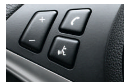
□ Voice control system, enables you to control radio stations, navigation destinations or telephone entries, as shown in the Control Display (this function is part of the navigation system Professional*).