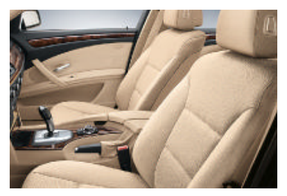
■ Standard seats with manual forward/ backward adjustment, electric seat height and backrest adjustment and manual seat angle adjustment (driver only).