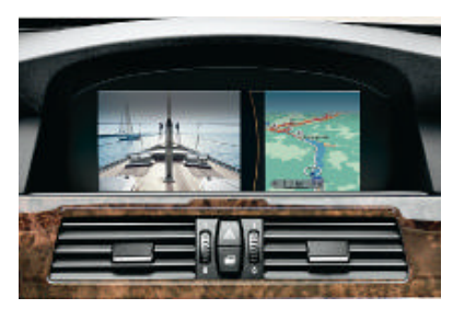
□ TV function enables you to use the Control Display as a TV set while the vehicle is stationary. Enables reception of terrestrial analogue and digital (DVB-T) channels.