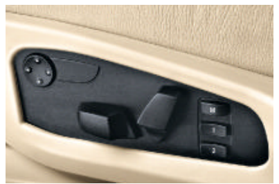
□ Electric seat adjustment for driver and front passenger. All seat planes and headrest height electrically adjustable, with memory function for driver's seat, exterior mirrors and steering column and automatic parking function for exterior mirror on the passenger side (standard on 540i, 550i and 535d).