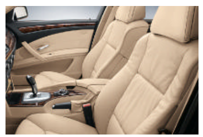
☐ Comfort seats for driver and front passenger, with electric adjustment, including comfort headrests (outer contact surface adjustable) with active function; with adjustment of upper backrest segment, backrest width and headrest height, including lumbar support and memory function for driver and passenger side, exterior mirrors and electrically adjustable steering column.