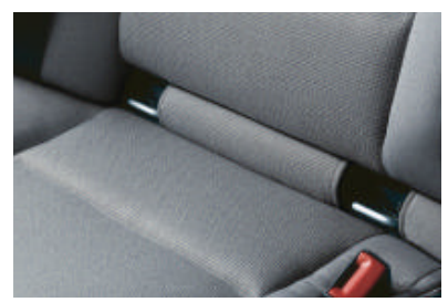
■ ISOFIX child seat fastening system in the rearfor the two outer seats enables easy and safe installation of the optional child seats via locking push connectors.

☐ Sun blinds for rear window, electric, and rear side windows, mechanical.