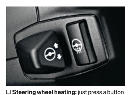
to quickly warm up the steering wheel rim – a particularly pleasant amenity in winter. Steering column, electrically adjustable, with automatic access, height and extension can be adjusted with the steering column switch on the left - for optimal ergonomic positioning (included with electronic seat adjustment).