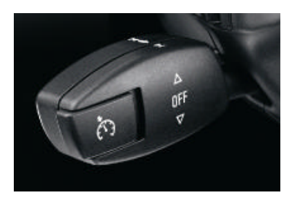
■ Cruise Control with brake function stores any desired speed upwards of approx. 30 km/h and maintains that speed (activated via left-hand control stalk).