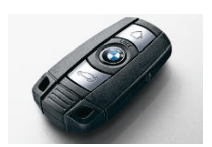
□ Comfort access system for opening and locking the vehicle without having to operate the radio remote control. It's enough to have the radio remote control in your pocket or bag. In addition, the engine can be started without the need for a key, using the Start/Stop button.