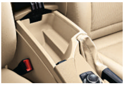
■ Armrest at the front, including storage compartment (shown here). □ Armrest at the front, moveable, including

☐ Armrest at the front, moveable, including storage tray (standard on 540i, 550i and 535d).