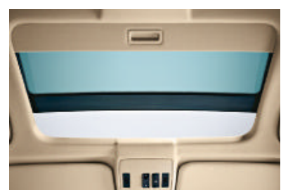
☐ Glass roof, with electric fingertip control for sliding back or raising the roof, trap release and comfort opening/closing function.