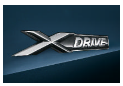
xDrive models are marked with a logo on both sidewalls.