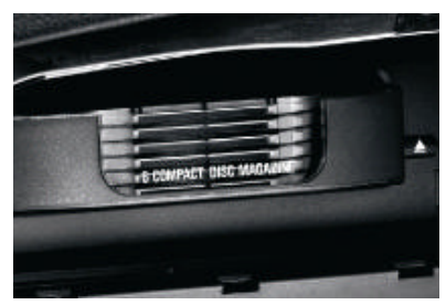
\square CD changer , for six CDs, integrated into the glove compartment.