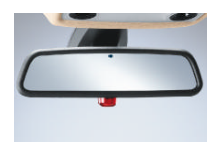
□ Interior mirror with automatic anti-glare function, large surface area; the glare from following vehicles is automatically reduced when the amount of incident light exceeds a defined limit.

□ Interior and exterior mirrors with automatic anti-glare function, including fold-in function for exterior mirrors.