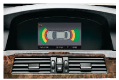
□ Park Distance Control (PDC), front and rear, facilitates parking and manoeuvring in confined spaces; the distance between your car and an obstacle is indicated by an acoustic signal and a visual representation in the Control Display.