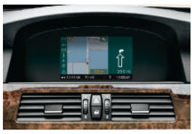
□ Navigation system Business* with colour 6.5 inch display including radio Professional. A shared drive for CD and navigation DVD. Traffic guidance via voice output and arrows or 2D route map if a navigation DVD is inserted. □ Navigation system Business* with integrated mobile phone preparation with Bluetooth interface.