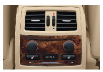
■ Fresh-air outlets at the rear. In conjunction with automatic air conditioning with extended features (shown here), these outlets provide temperature-controlled ventilation of the rear. ■ AUX-IN connection for an external audio device, e.g. an MP3 player. Together with the USB audio interface, the connection is located in the central console storage compartment.