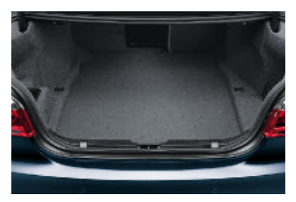
Luggage compartment with all-round textile lining, easily accessible.