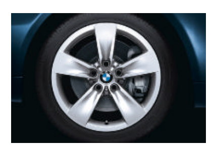
\Box BMW light-alloy wheels star-spoke 246 with runflat tyres , 8 J x 18 inch 245/40 R 18 tyres.