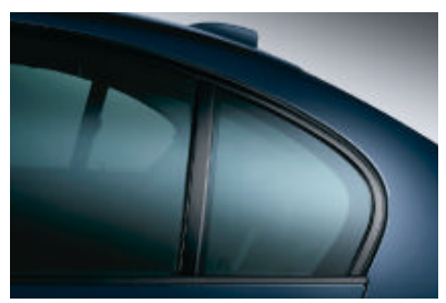
☐ Shadow Line comprises front and rear sidewindow frames and window recess finishers in Black, matt.

* Not available in all countries. Please consult your BMW partner.