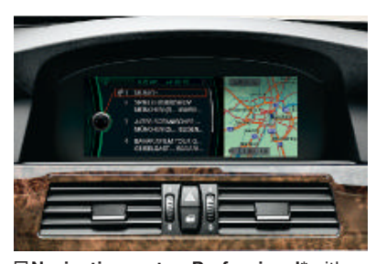
□ Navigation system Professional* with 8.8 inch colour display, incl. radio Professional, DVD drive, hard disk navigation including music collection. Directions provided by voice computer and arrows on the display or 3D route map, splitscreen function, voice control. □ Navigation system Professional* with integrated mobile phone preparation with Bluetooth interface for Telematics Services.