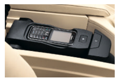
☐ Preparation for mobile phone with Bluetooth interface (including hands-free system, connections for recharging and external aerial). A separately available snap -in adapter enables connection of a Bluetoothcompatible mobile phone which can be operated by voice control or by using the multifunction buttons on the steering wheel. For further information, please contact your BMW partner.