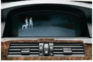
□ BMW Night Vision uses an infra-red camera to detect people and animals up to a distance of 300 metres. The camera images appear in the Control Display. This enables you to see obstacles that are still out of range of the headlights, so you can react in good time.