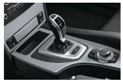
□ 6-speed sports automatic transmission with sports mode with short shifting times for particularly dynamic driving and paddles on the sports leather steering wheel (available for 530i, 550i, 530d and 535d, not in combination with xDrive).