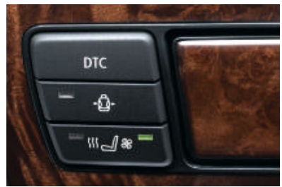
☐ Active seat ventilation enhances summer comfort by ensuring a pleasantly cool seat temperature. Ventilators in the seat surface and backrest blow air through the perforated seat covers. For driver and front passenger seat (only in conjunction with Nasca leather, not in conjunction with sports seats).