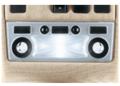
■ Courtesy lights with automatic function and soft on/off dimming when opening and closing the vehicle doors, centre console illuminated from above, reading lights front and rear.

□ Interior and exterior mirrors with automatic anti-glare function, including fold-in function for exterior mirrors.