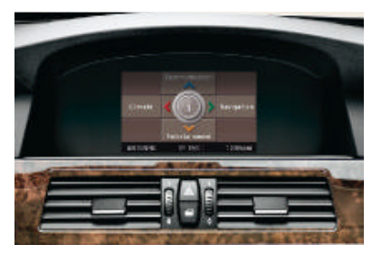
■ Control Display (6.5 inch, colour) for displaying functions that are accessed using the Controller (e.g. on-board computer or radio).