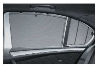
☐ Sun blind for rear window, mechanical, affords protection from intense sun, as well as prying eyes.

☐ Sun blinds for rear window, electric, and rear side windows, mechanical.