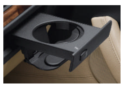
☐ Two cupholders at the front , integrated into the dashboard.

☐ Armrest at the front, moveable, including storage tray (standard on 540i, 550i and 535d).