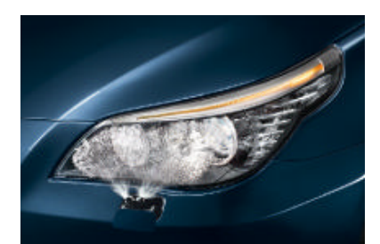
☐ Headlight washing system ensures optimum headlight brightness in all kinds of weather. When the lights are on, the headlights are automatically cleaned in parallel with the windscreen (only in combination with Xenon lights*).

☐ Adaptive Headlights, incl. turning light and variable light distribution for improved visibility in bends: the adjustable headlights are directed into the bend when the vehicle starts cornering. ☐ High-beam assistant for automatic high and low beam.