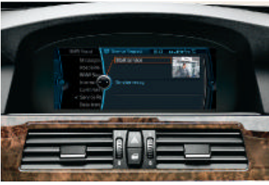
□ BMW TeleServices*. Servicing requirements are automatically detected by your BMW and a message with all service-relevant details is sent to your BMW partner well ahead of the service due date. Your BMW partner will then make an appointment with you. This service is only available in connection with Bluetooth mobile phone preparation and BMW Radio Professional.