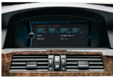
□ BMW Online* provides access to a range of online services. In addition to an e-mail account, customised portals offer news, stock market updates, parking info and weather forecasts. And with Google's "find businesses" facility you can download all relevant information directly from the Google Maps database to your BMW.