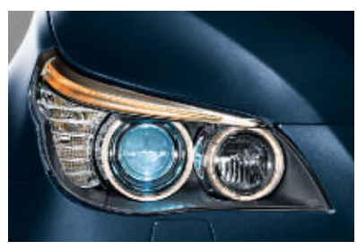
☐ Xenon Headlights for high and low beam, with automatic headlight range control, daytime driving lights with light rings.

☐ Adaptive Headlights, incl. turning light and variable light distribution for improved visibility in bends: the adjustable headlights are directed into the bend when the vehicle starts cornering. ☐ High-beam assistant for automatic high and low beam.