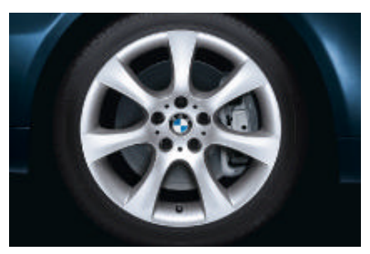
□ BMW light-alloy wheels star-spoke 124 with runflat tyres and mixed tyres, 8 J x 18 inch, 245/40 R 18 tyres at the front, 9 J x 18 inch, 275/35 R 18 tyres at the rear.