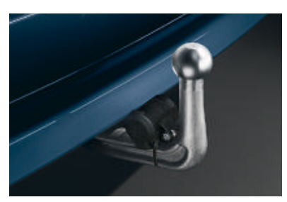
\square Tow bar with removable ball head (only in combination with Sports Edition).

\square Tow bar with electric pivot ball head (shown here).