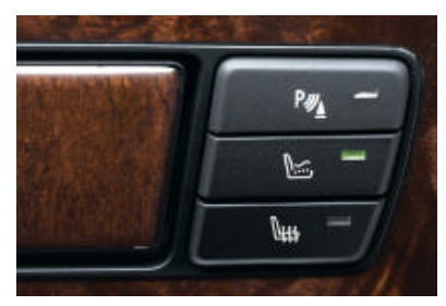
☐ Active seats (for driver and front passenger) make for relaxed sitting and driving on longer journeys. Pelvis and lumbar vertebrae are mobilised by alternating, cyclical up/down adjustments of the seat surface.