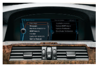
□ BMW Assist* supports the driver with an automatic and manual emergency call function, enabling your vehicle's location to be pinpointed to the metre, traffic Info plus and My Info, which enables SMS and address data to be sent to your BMW. Additionally you benefit from a free, round-the-clock personal information service.