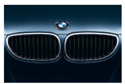
■ Ornamental front grille with black kidney grille slats and chrome surround (standard on 520i and 520d).