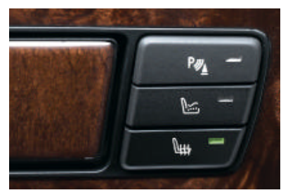
☐ Seat heating for driver and front passenger seat. Seat surface and backrest are heated and quickly radiate comfortable warmth (standard on 550i).