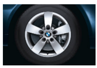
■ BMW light-alloy wheels star-spoke 242, 7 J x 16 inch, 225/55 R 16 tyres (standard on 520i, 523i, 525i, 520d and 525d).