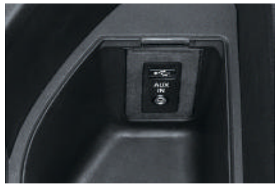
□ USB/audio interface allows Apple iPods, MP3 players and USB sticks to be connected for listening to audio files. Operation and playback via the controller, the functional bookmarks, the steering wheel buttons or the relevant audio system.