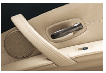
☐ HiFi system Professional LOGIC 7 provides truly outstanding sound, 13 loudspeakers creating a luxurious soundscape all around you. ☐ HiFi loudspeaker system with ten loudspeakers ensures brilliant sound.