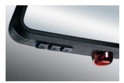
☐ Garage door opener, integrated, provides additional comfort. The self-teaching remote control unit enables you to open and close your garden gate or garage door from within your vehicle.