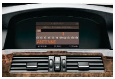
■ Radio Business, 4-channel amplifier, aerial diversity, scan function, CD drive with title scan and automatic CD insert/eject, six loudspeakers and MP3 decoder.