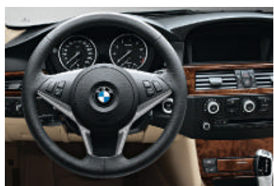
□ Sports leather steering wheel, very comfortable grip thanks to small diameter (379 mm), three spokes, with multifunction buttons; the integrated buttons can be used to operate the radio, CD drive and telephone (optional) while on the move. Two buttons are available for user-defined functions.