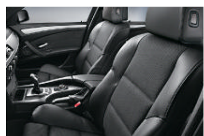
☐ Sports seats for the driver and front passenger provide optimum lateral support thanks to highly contoured seat sides; with individual electric adjustment of seat height and backrest angle, and manual adjustment of seat angle, forward/backward position and thigh support.