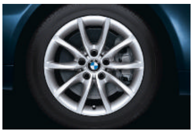
☐ BMW light-alloy wheels V-spoke 245 with runflat tyres, 8 J x 17 inch, 245/45 R 17 tyres.