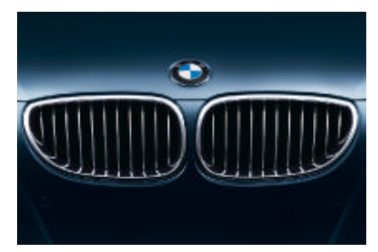
■ Ornamental front grille with chrome kidney grille slats and chrome surround (standard on all six-cylinder and eight-cylinder models).

\square Tow bar with electric pivot ball head (shown here).