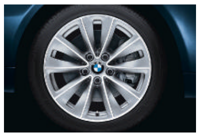
□ BMW light-alloy wheels double-spoke 247, forged, with runflat tyres and mixed tyres, 8 J x 18 inch 245/40 R 18 tyres at the front, 9 J x 18 inch 275/35 R 18 tyres at the rear (slate grey rims, partly-polished).