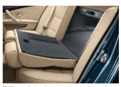
□ Through-loading system with 2:1 split folding rear seats. The ski bag included in this option allows clean and safe transportation of up to four pairs of skis with max. four people on board. If the ski bag is not required, it can be tucked away in a replaceable container to save space (includes 12-V socket in the boot).

☐ ISOFIX child seat fastening system for front passenger seat with airbag deactivation.