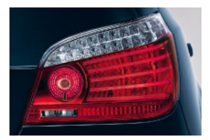
■ Rear light with LED indicators and five radial LED light conductors ensures optimum recognition even in poor visibility. Clear glass sets off this high-quality, modern lighting technology, making for an individual appearance.