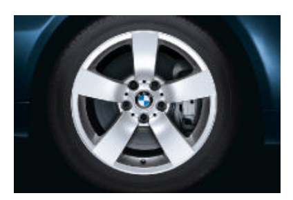
☐ BMW light-alloy wheels star-spoke 122 with runflat tyres 8 J x 17 inch, 245/45 R 17.