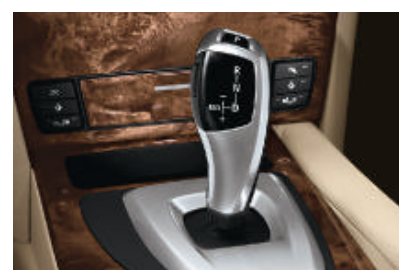
☐ 6-speed automatic transmission with Steptronic. The gearshift mechanism enables very fast, immaculate gear changes – for truly dynamic performance (standard on 535d).

■ 6-speed manual transmission enables a very sporty drive. Smooth, with perfect ratios and precise, short-throw gearshifts. The addition of a 6th gear and the reduced spacing of gear ratios mean that you can make even more individual use of the engine power provided (not available for 535d).