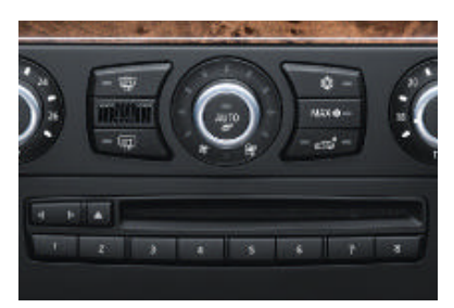
■ Functional bookmarks: The driver's and passenger's most frequently used navigational targets and telephone numbers or specific CD tracks can be individually stored on eight separate buttons and accessed with a click.