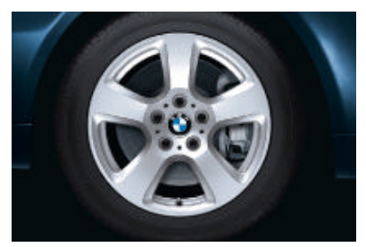
□ BMW light-alloy wheels star-spoke 243, 7.5 J x 17 inch, 225/50 R 17 tyres (standard on 525i xDrive, 530i, 530i xDrive, 525d xDrive, 530d and 530d xDrive).