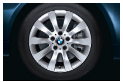
\square BMW light-alloy wheels radial-spoke 244, 7.5 J x 17 inch, 225/50 R 17 tyres (standard on 540i and 535d).