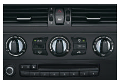
■ Automatic air conditioning with microfilter, enabling you to enjoy your favourite climatic conditions at any time of the year; automatic temperature and air volume control, flap control, ventilation in the rear, status and settings shown on the Control Display.