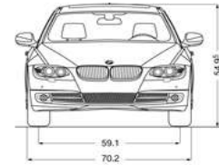
Illustrations above: all dimensions in inches.