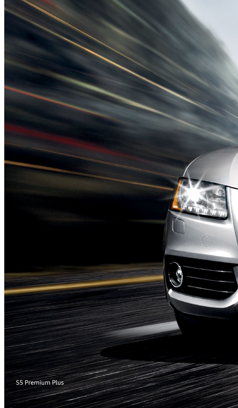
S5 Premium Plus

It's obvious, the S5 has no peer. Standard quattro® all-wheel drive and the available Sport Rear Differential add handling that has to be experienced to be believed.