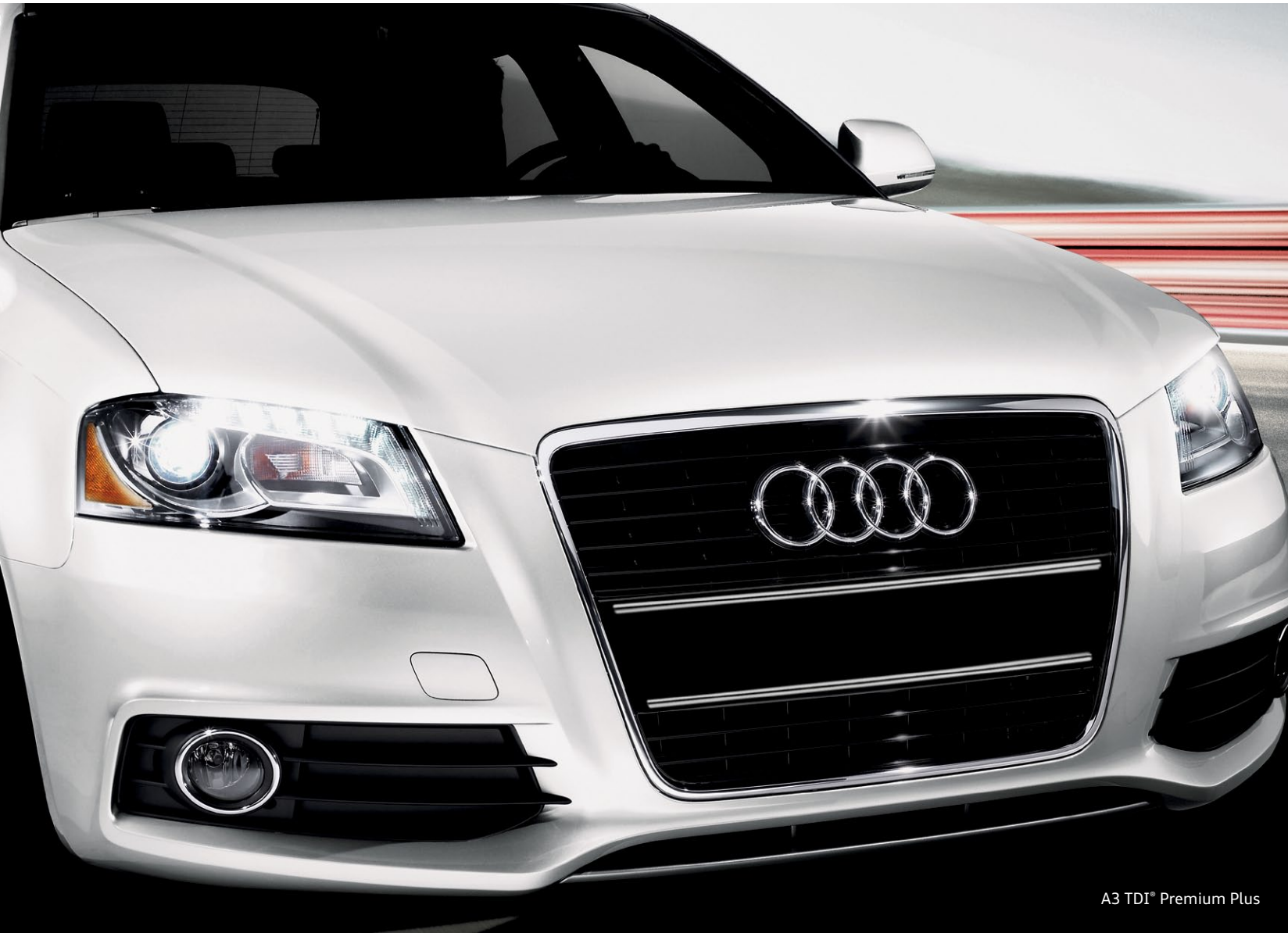
A3 TDI® Premium Plus