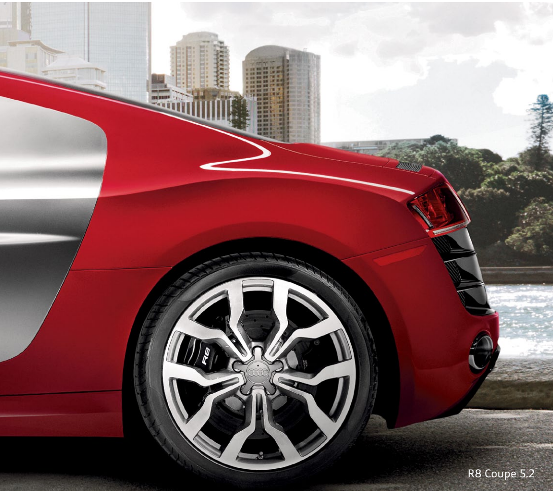
R8 Coupe 5.2

A rare and exclusive supercar with high design, captivating refinement and a heritage of racing dominance. With a mid-mounted 525hp V10, quattro® all-wheel drive and an aluminum and magnesium Audi Space Frame (ASF®), the R8 Coupe 5.2 offers handling and balance worthy of any racetrack. It's indisputable, the R8 5.2 raises the bar on power, speed and performance, inventing a new category altogether.