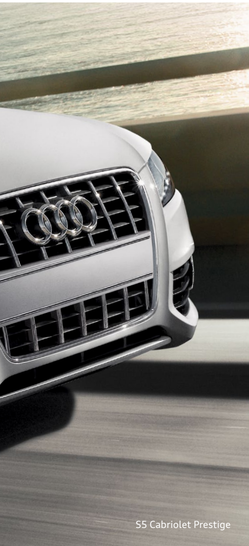
S5 Cabriolet Prestige