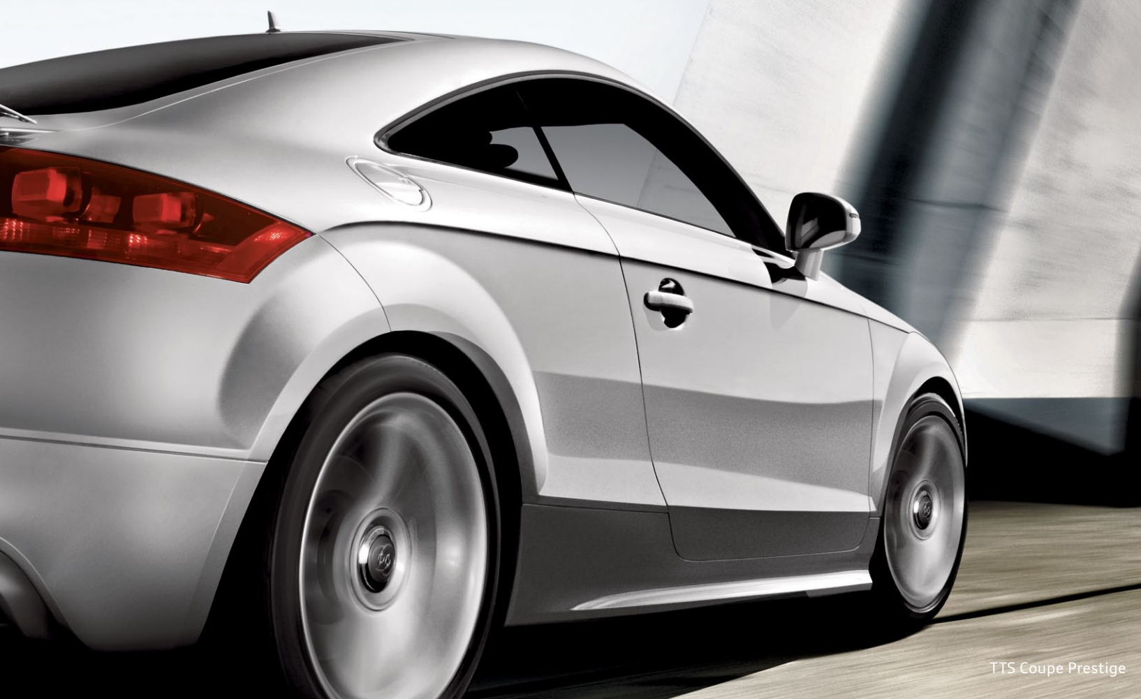
TTS Coupe Prestige

The TTS is equipped with a 2.0 TFSI® engine that offers a substantial 265hp and 258 lb-ft. of torque. Combined with quattro® all-wheel drive and the lightning-fast, S tronic® dual-clutch transmission with launch control, the