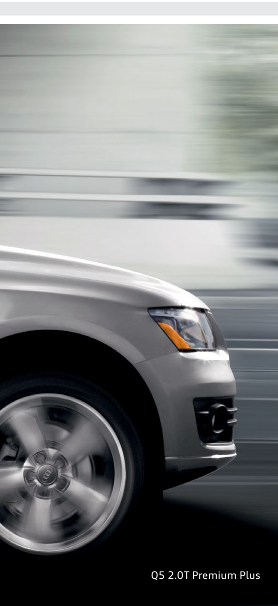
Q5 2.0T Premium Plus