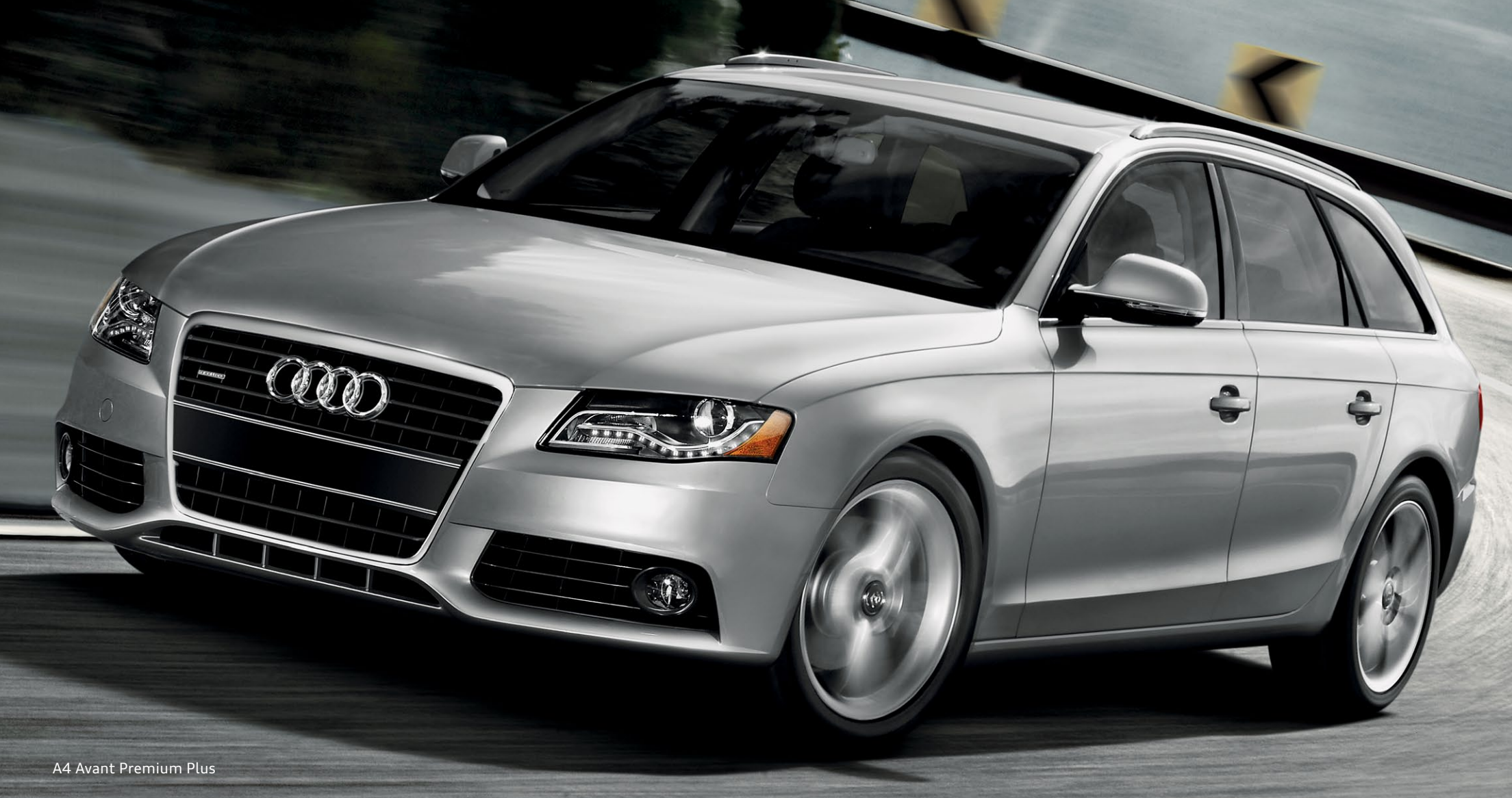
A4 Avant Premium Plus