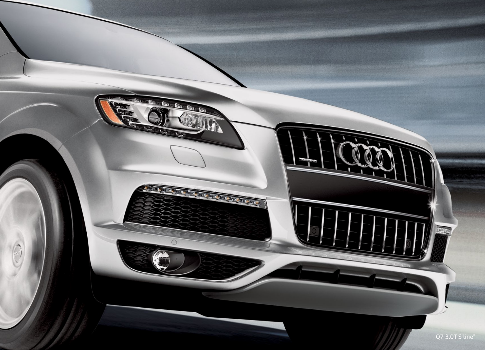
Q7 3.0T S line®