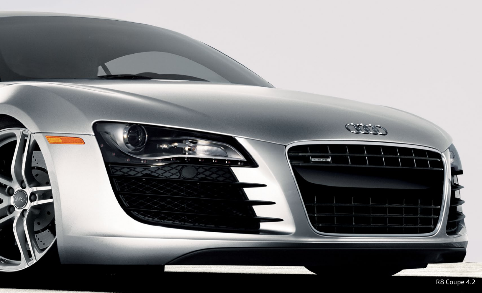
R8 Coupe 4.2