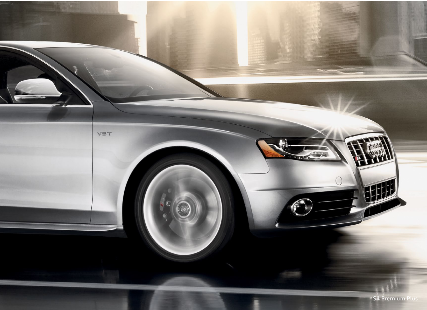
S4 Premium Plus